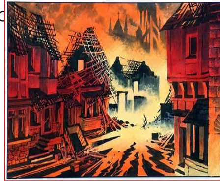
Ron Embleton- Great Fire of London